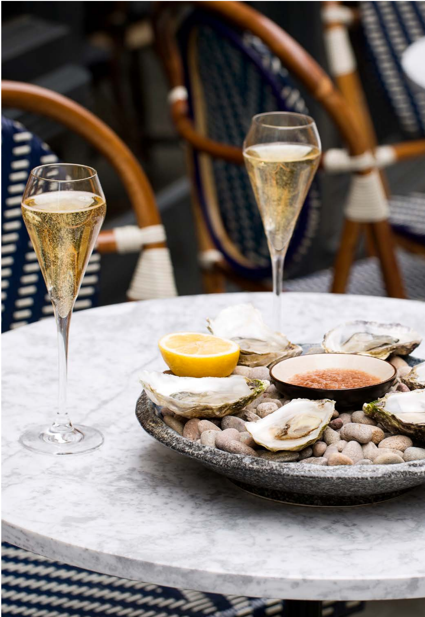
Comptoir Café & Wine