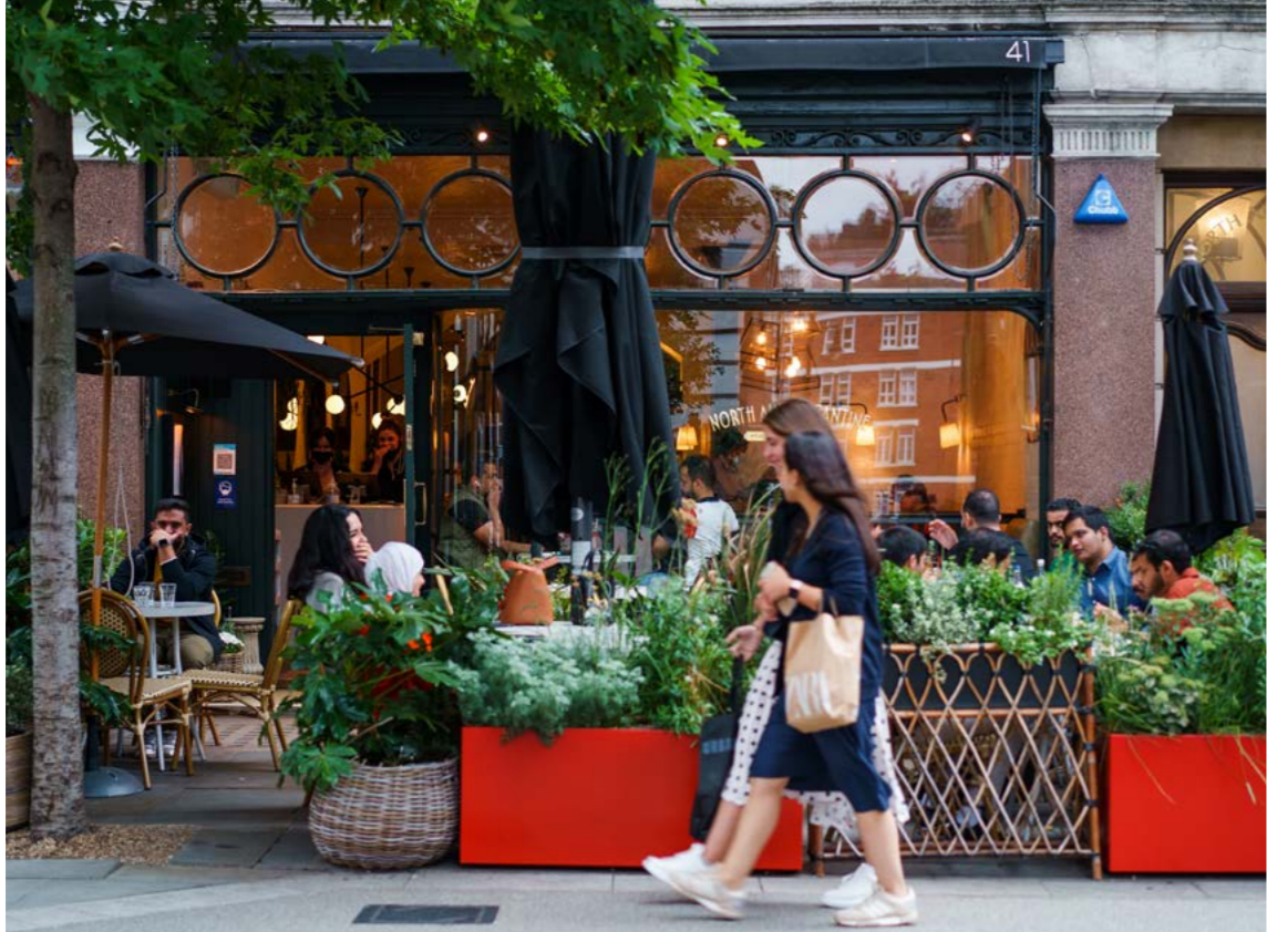
North Audley Cantine (NAC)