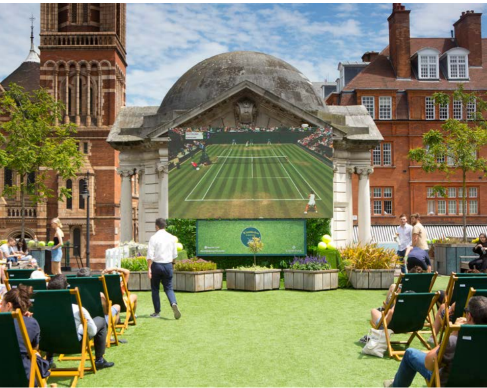
Brown Hart Gardens