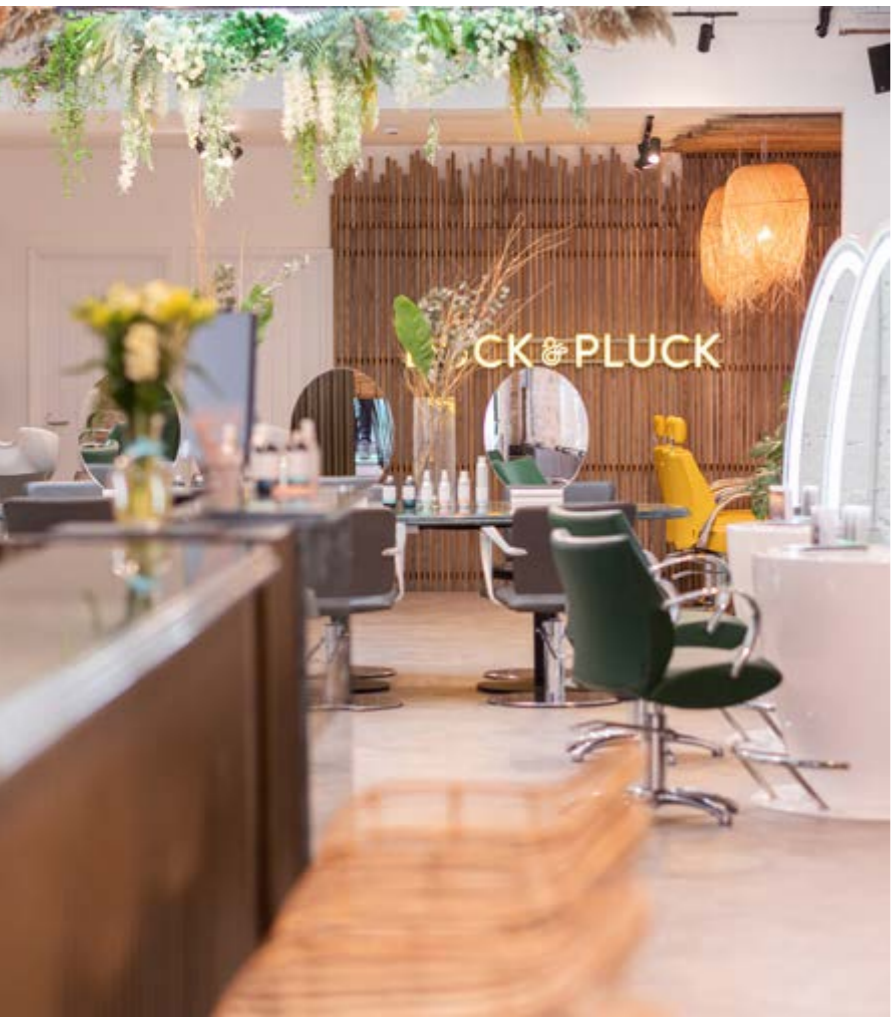
Duck & Dry